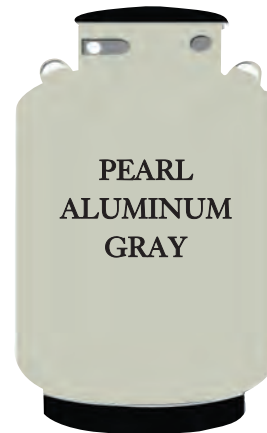
PEARL ALUMINUM GRAY