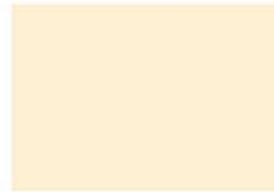
Antique White 885W2109